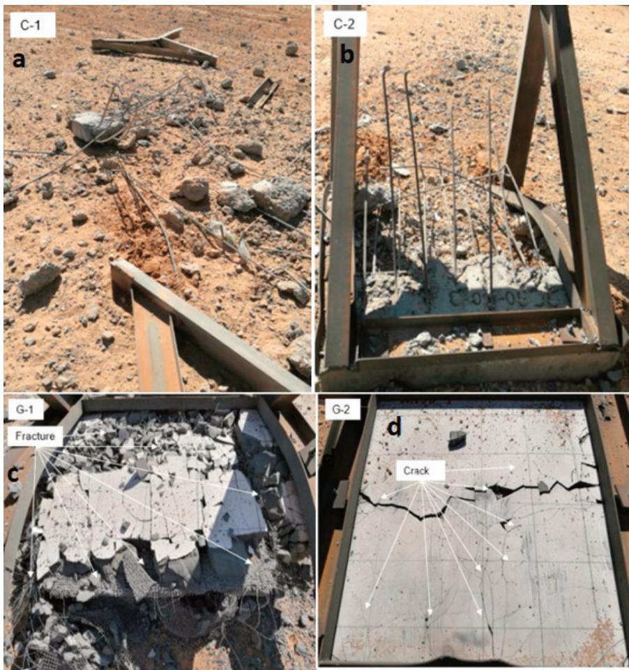
Fig. 5 Remnants of (a) concrete 3 m from explosion, (b) concrete 5 m from explosion, (c) geopolymer 3 m from explosion and (d) geopolymer 5 m from explosion [53]

in time, limiting their applications. For these reasons, various shielding materials are developed, including geopolymer-based materials [55]. While having low shielding capability by themselves (due to their relatively low conductivity), geopolymers may serve as a matrix for electromagnetic shielding composites. In addition to metal grids, various other types of conductive materials may be used, including carbon and basalt grids, which are also significantly lighter than metal sheets or grids. Geopolymers may also be foamed, which further reduces their density, making them an ideal material for electromagnetic shielding composite manufacturing, as they do not significantly increase the weight of whole structures, while creating Faraday cage [56]. Military applications of EMF shielding include the protection of personnel in the vicinity of strong sources of electromagnetic fields (radars, transmitters, jammers etc.), protection of equipment or structures against EMI (Electromagnetic interference) or even defense against electromagnetic (electronic) warfare, which may disrupt the function of complex electronics, block transmissions etc. [57].