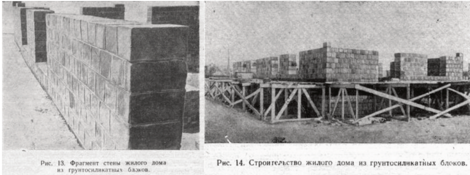
Рис. 13. Фрагмент стены жилого дома из грунтосиликатных блоков.

Viktor Glukhovskiy, who also discovered their zeolitic structure. He called the new material “gruntocements” (meaning “soil cements”, also called “gruntosilicates”) and described them in his publication “Gruntosilikaty” [30]. Geopolymers were used in USSR for building railway sleepers, sewers, buildings etc., as seen in Fig. 1.