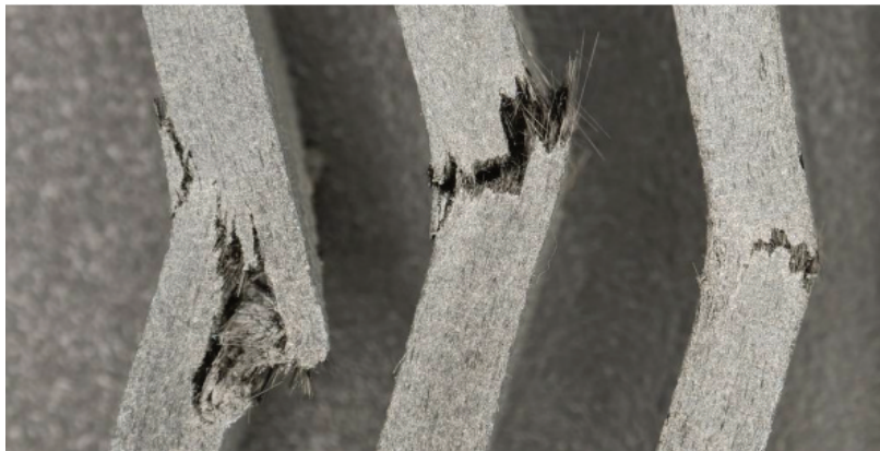
Fig. 4 Geopolymer/recycled carbon fiber composite for aviation industry after flexural strength test [46]