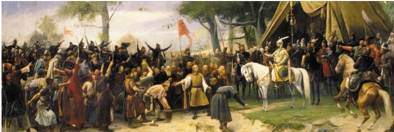
Fig. 2 Settlement of the Magyars in Hungary. (National Gallery, Budapest, Hungary. Painter: Mihály Munkácsy, 1893)

There are some assumptions that the origin of the word robot is traced back to the archaic Slavonic word rab , meaning unfree person [1]. The historical origin could link back to the conquering of the ancient Slav residents settled in the Carpathian Basin by the Magyars in 896 AD (see Fig. 2).