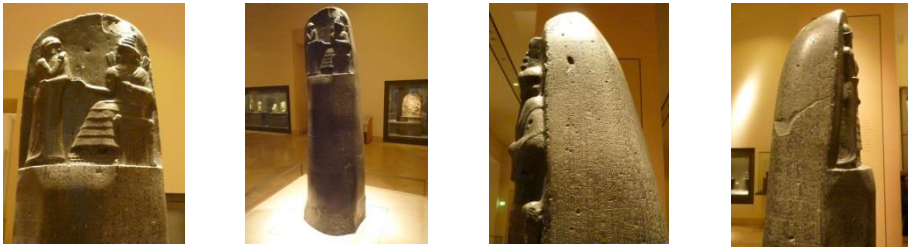
Fig. 4 The Diorite Stele with Code of Hammurabi (Photo by R. Szabolcsi. The Louvre, Paris, France 2011)

The Code of Hammurabi in fact is a collection of the adjudications of him and it is more than a classical code of law. The reason is that only the God could create a law, and the mission of the kings was the “ kittu(m) ”, so as to keep the truth of god in force (see Fig. 4).