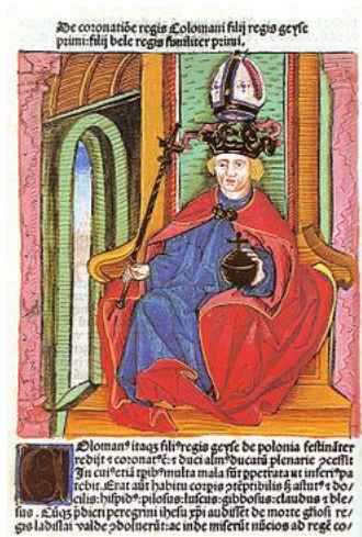
Fig. 7 King of Hungary Coloman I – The Book-Lover [40]

His royal legislation work reached the pick in the Synod of Tarcal, where the prelates and barons of the Hungarian Kingdom revised the laws of the preceding kings. King Coloman issued new decrees reducing sensitivity of the laws of King Saint Ladislaus I [4, 6].