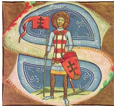
Fig. 5 King Saint Stephen with the flag and double cross [40]

Saint Stephen I (Hungarian: I. Szent István ; Latin: Sanctus Stephanus ; Slovak: Štefan I. or Štefan Veľký ) is the first Hungarian King, the founder of the Hungarian Kingdom (see Fig. 5).