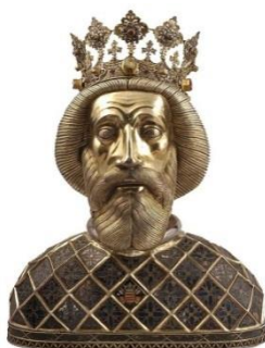
Fig. 6 The golden herma of the King Saint Ladislaus I of Hungary [40]

King Ladislaus I of the Dynasty of Árpád reigned in the Hungarian Kingdom between 1077 and 1095 (see Fig. 6). As a king he was said to be a righteous lawmaker. His main motivation was to prevent private properties of the owners [4, 6].